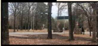
Front Drive Asphalt Spreading!

Each and every day we get a little bit closer to reaching our goals! I look forward to sharing our successes with all of you as we progress!