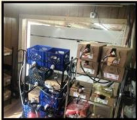
Wall Opening for New Ice Merchandiser!