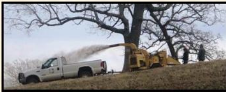
Wood Chipper in Action!

Yep, still cold. How many days 'til Spring? Bring on the sunshine and warmer weather! It's been another busy, productive week here! We're still working through our long list of off season improvements here at the Ranch. We have recently purchased a wood chipper to increase efficiency while trimming trees and landscaping around the property. No more loading, hauling, unloading and burning! Yeah! We also opened up the wall behind the ice merchandiser in the Trading Post to make room for a much larger merchandiser. This will allow for a lot more ice to be available during peak season, thus cutting down on labor to move it from the freezer truck to the store. In addition to that, we are utilizing the old asphalt from the road improvement project to fill in areas that need it along the front drive. Our maintenance crew also created an opening/ doorway above the Big Top restrooms to allow for future repairs on the inside roof area.