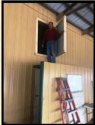
New Wall Opening for Big Top!