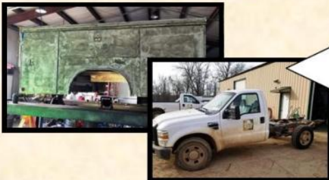
Maint. Truck Bed Replacement!

All departments are gearing up for the huge season ahead. In anticipation of another busy season this year, we are discussing our hiring plan. We will be hiring in all departments very soon and look forward to creating a fantastic Ranch Staff for the 2021 season! If you know anyone that might be interested, please send them our direction! We need smiling faces! The Valentine Trail Hunt is up next on February 13th! I hope to see everyone there! It looks like a great time! I'm sure your honey will thank you! Speaking of Valentines Day, I know it sounds "CORN-Y" but I think you're all "a-MAIZE-ing"!