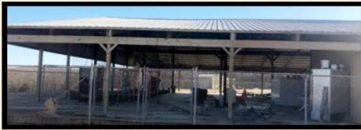
Rafter Header/Big Top

We are still chipping away at the more time consuming projects, such as the tree trimming and clean-up around the ranch, as well as the Compound 7 project, weather permitting. The Big Top project is in the second stage of repairs, we are currently working on the rafter header. Sometimes new, unexpected projects have to be pushed to the top of list. A plumbing issue was recently discovered in the Shady Lane rental which has forced us to replace the flooring and faulty plumbing in the 3rd bedroom and bathroom area. This has been quite time consuming, but we hope to have this completely very soon.