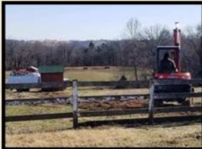
Underground Power line to well house!

Special thanks to the Cloud 9 Ranch Volunteer Fire Department, First Responders, Staff and Members that assisted in the camper fire on Wednesday in Lonesome Pines Campground. The quick response time and containment prevented the fire from spreading to other areas.