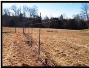
New Fence at Lagoon!

Can you believe it's already March? This year is flying by! Before we know it the Ranch will be buzzing again in full swing! I'm ready! We've had a busy week. Maintenance replaced an underground power line to the Stables well house. We are also making progress on the fencing around the lagoon area. One full side is completed and we are working on the remaining areas. Cross your fingers that the weather holds steady to finish this project quickly and move on to other pending projects.