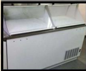
New Ice Cream Merchandiser!

Full speed ahead folks! So many fun events scheduled for the holiday! If you haven't participated in the past, be sure to take the time to do at least one event while you're here! I'm sure you won't be disappointed!