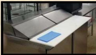
New Cold Condiment Unit!