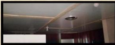
Big Top Ladies Restroom Ceiling!

One week to go! Memorial Day is fast approaching and it's all hands on deck! The rain has not been our friend the past few weeks and it continues to come and go. It needs to just GO for awhile! Our crew has been busy putting the finishing touches on the Big Top and getting the pools ready. The ceiling has been redone in the ladies restroom at the Big Top and the men's will be next! We also received our new cold condiment unit to be used for Hunt Brothers PIZZA toppings at the Big Top this season! Yes, you heard it correctly! Pizza at the Big Top! Our new ice cream merchandiser is also here! We will have more delicious flavors to offer this year! The sun is out today and the mowers and weed eaters are getting a good workout, along with our crew! In case you haven't heard, Fogey Hollow is now open to campers as well!