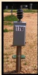
New lights on Electric Boxes!