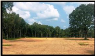
Gravel Roads in New Campground!

Like most businesses throughout the nation, we continue to be short-staffed here at the Ranch. We currently have a total of 5 employees out due to COVID, two of which are from the accounting office. Keep in mind, our full staff is 80 employees. Be assured, as we have from the beginning of the Pandemic, we continue to work closely with the Ozark County Health Department regarding each individual case and are following the guidelines we receive from them. We are continuing to monitor the situation and hope to be back to regular hours very soon.