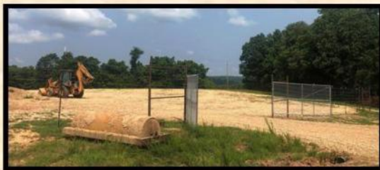
Fencing/Gate- Compound 7!

I wanted to give everyone an update on the projects around the Ranch. The new campground is nearing completion. We are now adding gravel to the roads. Please continue to stay out of that area. The flags were placed around the boarder in an effort to keep things in place as we work this project. We also installed lights above all the electric boxes for easier parking after dark. These lights are powered when the 20amp is turned on in the electric box. They will automatically come on after dark. Compound 7 now has a fence and a gate! We will be adding more gravel once the new campground is completed. We also added a new culvert to the entrance of Chickadee Trail off the main road from Hill Country to Powder Mill. This should help with a lot of the runoff in this area.