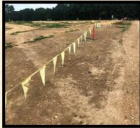
Flags Bordering New Campground!