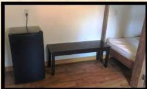
New Mini Refrigerator in Bunk House!

I had the opportunity to look over the lineup for this weekends events. If you miss this one, you will be sorry! I can't even wrap my head around how many fantastic prizes and raffle items are listed! Two Live Bands, Vendors, Contests, a Silent Auction, Fireworks, Giveaways, and even a girl with a hula hoop on fire! What??? Bring it on!