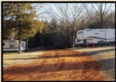
Road work in Hill Country Annex!

If you haven't had an opportunity to visit the Wilder area lately, you're in for a treat. Lot's of great changes are happening and I'm sure you will be thrilled. Hat's off to all our volunteers for assisting in this effort! Don't forget the Board of Directors meeting this Saturday, 9am, in the Pavilion.