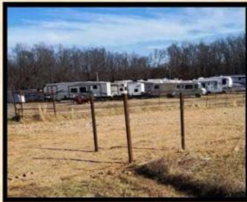
Corner posts in Compound 6!

Our maintenance crew has been busy this week. The corner posts have been driven in for the Compound 6 expansion project. This should give us approximately 25 more spots when completed. In addition to that we have been hauling materials and working on the Hill Country Annex roads. We hope to have most of the campground roads in much better shape by Spring!