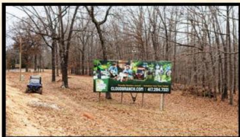
New Billboard on 160!

With Valentines Day right around the corner, mark your calendars to attend the Conservation Committee's Valentine Heart Trail Hunt! It's scheduled for Saturday, February 12th. Registration is 11am-12pm and the hunt starts at noon. Come show your "Love" for the great outdoors!