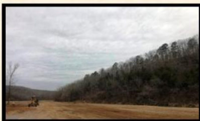
Ground Work in Fogey!

The 2nd large billboard is now up on Highway 160 facing East. Both signs look great!