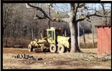
Work around Craft House!