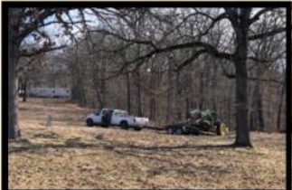
Cleanup in Shady Lane Area!

Maintenance and Resource have been working the ground leveling project around the Craft House this week. We have also worked the ground in Wilder 2 to help with the water drainage issues we've experienced in the past. A portion of the guys worked the Shady Lane area and behind Cabin Row doing tree trimming and clean up as well.