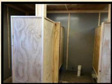
Progress in Big Top Restrooms!

Our maintenance and resource departments have been busy this week. The fencing is coming right along on the Compound 6 expansion. This will allow us to start renting out spots very soon. We're also hard at work on the Big Top Restroom remodel project. In addition to these, we continue to work on the tree trimming and brush removal in areas around the Ranch.