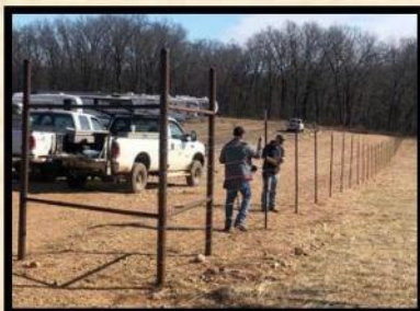
Compound 6 Expansion!

I had an opportunity to check out the event flyers recently added to the "Things to Do" - "Events" Tab on the website a few days ago. Even though they are only up to May, Wow! This years' 50th Anniversary Celebration is going to be a blast! I can't wait! One last thing.. In honor of Valentines Day quickly approaching, I just have to say..I LOVE THIS RANCH!