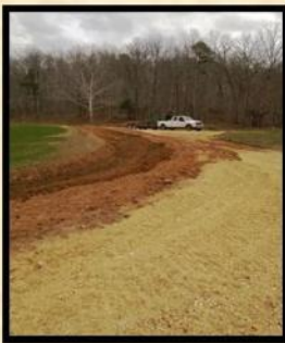
Road Work in Fogey!

We were able to work on the upper road in Fogey Campground prior to the rains arrival. It is looking much better. We have also added 4 power boxes and water to the "New Vendor Row" in front of Lonesome Pines Campground. This will allow for 8 vendor spots with power and water.