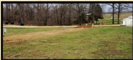
Electric & Water at New Vendor Row!

We had a great turnout for the 1st Extreme Group Ride on Saturday. Thanks to all involved in making that a success. Conservation has their first trout stocking on April 15th. Easter is right around the corner and the Ranch has a fun and exciting lineup for Saturday April 16th! The Ranch Riders also have their first Marble Run of the year scheduled for the 16th. Plan to bring the family and spend an awesome day at the Ranch!