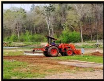
Dirt Work in Wilder 2!

Wolfman will be set-up and ready to play all your favorites at the T-Top this Saturday night at 8pm. Bring your dancing shoes!