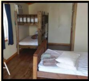
New Bunks in Melody #53!