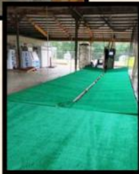
New Carpet at Batting Cage!

If you haven't registered for the Labor Day Weekend Blues & BBQ Cook-off yet, you better hurry. The deadline to sign-up at the Trading Post is Monday, August 29th. Lots of big money to be won with this event! Hey, it's also a GOLDEN TICKET event!