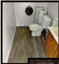
New Flooring in Fitness Bathroom!