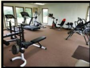
New Flooring in Fitness Room!

We've done a few upgrades over the last few days. The fitness room and restrooms received new flooring. The batting cage also received new carpet! These areas both look great.