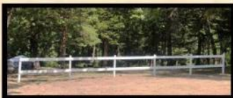
New fence in Hill Country!

Maintenance built a new fence in Hill Country this week. This is located directly behind the little rental cabin HC#15 at the edge of the campground. No more driving behind the pads in this area. We are also in the process of repainting the carwash. This project should be completed by the end of the week. Additionally, in an effort to protect our asphalt edging on the new roads, we have placed large rocks to block anyone from "cutting through" and making their own road off Hoots n Hollers trail.