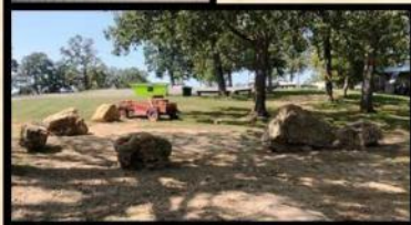
New Rocks off Hoots n Hollers!

Missouri Bow Season opened today at the Ranch. Be aware of hunters in the woods. Our herd has steadily grown over the last few years and we depend on these hunters to thin our herd every year to keep our deer at a good number for us to maintain. Without these folks helping with our deer management, our deer would suffer due to lack of natural resources, deer vs. land. Good Luck Hunters!