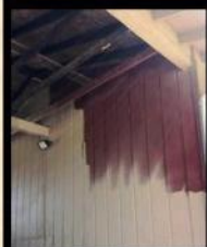
New paint in carwash!