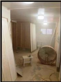
Work in Fogey Stage Stop

Speaking of rain, it has put a temporary halt on our road work progress in Lonesome. As the rain continues, maintenance is currently working on the Lonesome Pines Stage Stop project and has also begun work in the Fogey Stage Stop as well. As you know, we are adding handicap showers and toilets in both locations. We also added LED lighting to the shuffle board court this week. Now I can see clearly when I am losing! Ha!