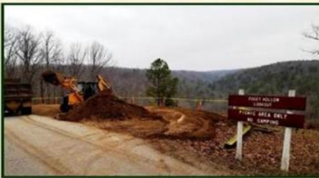
Fogey Hollow Lookout

The new snowplow and salt spreader was put to good use last week! It used to take 3 1/2 to 4 hours to salt the front drive. It only took 25 minutes this time with new salt spreader! Much more efficient! The Fogey Hollow Lookout area is getting some attention. The parking area is being reworked so it will be in great shape this Spring!