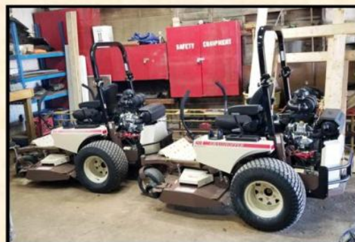
Two New Mowers

The Trading Post is stocking up for the season. The newest addition is becoming a distributor of AMSOIL Products!