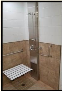
Handicap Accessible Shower

Is your camping gear, camper, and your bike ready for this season? The Trading Post is stocking all kinds of parts for your camper and ride!!! We also have you taken care of for those Spring BBQ's and Bonfires! Speaking of Spring remember to set your clocks forward an hour this Saturday night for the Spring forward time change. We are just about to wrap up this winter season. More grading on the roads has been completed. Our crew is working hard on completing the Fogey Stage Stop. The Lonesome Pines Stage Stops are almost complete, painting the floor, then a little more cleaning and it will be ready for use!