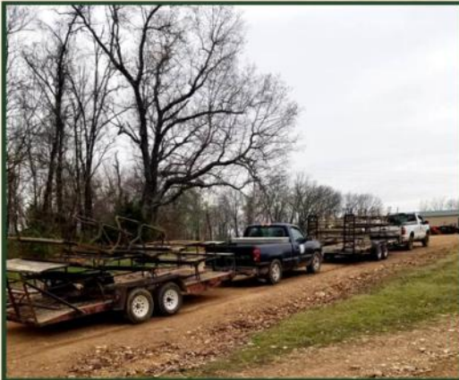
ROAD WORK CONTINUES

The Maintenance Department has been replacing the old worn out picnic tables. They fought the good fight and held on as long as they could. Special thanks to all the volunteers that have helped with the assembly of the new Picnic tables. Road ditch cutting and road shoulder trimming work continues.