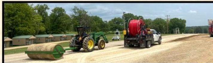
Gravel Added to Big Top Parking Area!

You are invited to attend the Board of Directors Meeting this Saturday, May 13th at the Pavilion. The meeting will start a 9am. Make sure to mark your calendars for Saturday May 20th! It's sure to be a fantastic weekend with the Spring Festival, Poker Run, and Jeremiah Johnson Band!! Check the 2023 Events Schedule for all upcoming events at www.cloud9ranch.com/events/ . See you all around the Ranch, now get out there and have some fun!