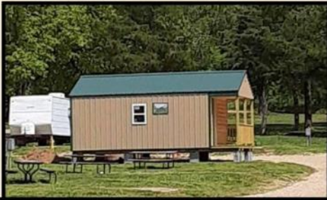
New Cabin in Hill Country!

We are almost half-way through the month of May already! The weather is forecasted to be up into the 80s this weekend, which will be perfect for a trip out to the Ranch to camp, ride, or to cool off at Fogey Tubes in our spring fed stream! Bring your wet gear incase it rains! Maintenance has been very busy this week getting everything working smoothly and ready for our first Holiday of the season, Memorial Weekend! The three night Holiday Pad requirement for Memorial Day weekend this year is Friday, Saturday, & Sunday nights. Remember if your camper is out, you must occupy it all three nights. Howell-Oregon has completed the replacing of the primary wire at the Big Top. Also at the Big Top the parking lot now has some new gravel as well as the Fogey Lookout.