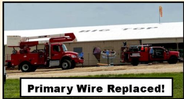
Primary Wire Replaced!