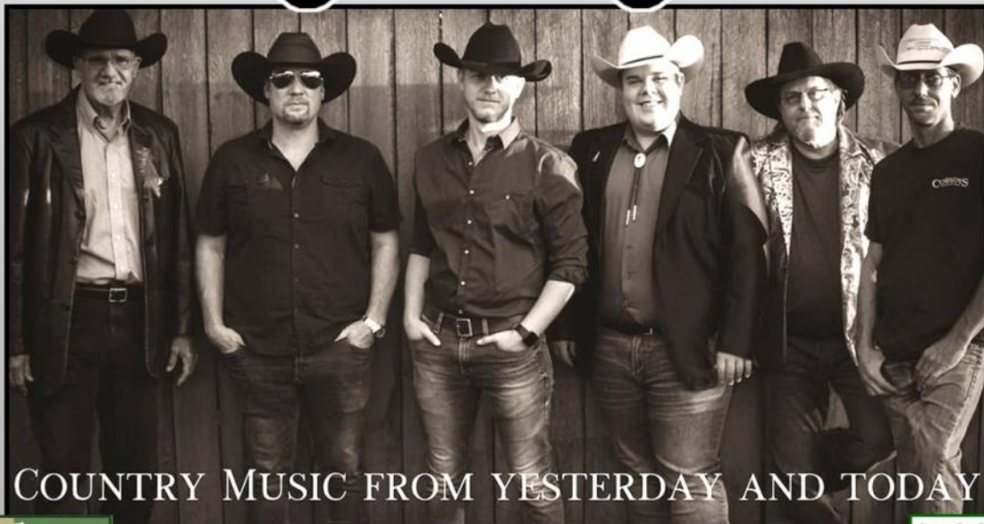
COUNTRY MUSIC FROM YESTERDAY AND TODAY