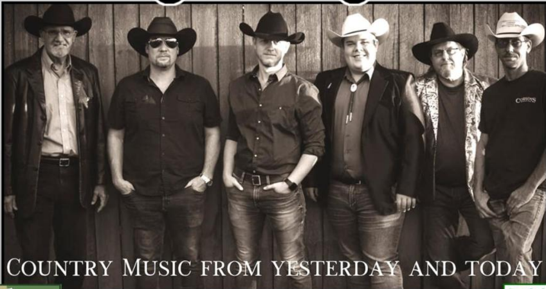
COUNTRY MUSIC FROM YESTERDAY AND TODAY