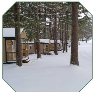
It's not here yet, but this is what the Ranch will look like.